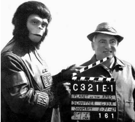
"Planet of the Apes" [1967]

Leon Shamroy, A.S.C. (16 July 1901, New York City – 7 July 1974, Los Angeles) was an American film cinematographer. Together with Charles Lang, he holds the record for most number of Academy Award nominations for Cinematography. Throughout his five-decade career, he garnered eighteen nominations with four wins. From 1953 to his death in 1974, he was married to movie actress Mary Anderson.