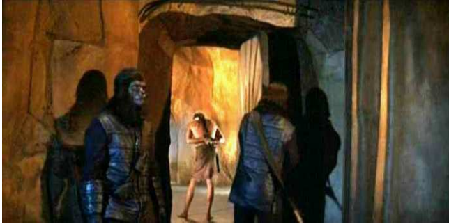
"Planet of the Apes"