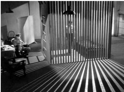
You Only Live Once (1937)

Self: The 36th Annual Academy Awards (1964) (TV) .... Himself - Best Cinematography [Color] Winner