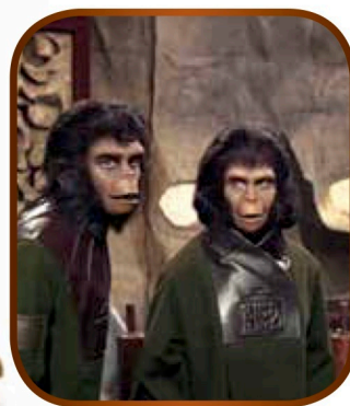
535. PLANET OF THE APES PAIRS OF APE BOOTS (3) INCLUDING KIM HUNTER "ZIRA", PLUS EXTRA ARTICLES. (TCF, 1968) Elaborately crafted female or child chimpanzee-character feet/boot pairs (3) including (1) tagged for Kim Hunter as "Zira" in the original Planet of the Apes . Crafted in foot-shapes over women's tennis shoes, the "Zira" pair have a more elaborate hook & eye and velcro closure, while the two background pairs have simple zipper closure. Sizes are women's 5, 7, and 8. Also in this lot are (2) molded tunic-emblems, a knitted "chest-hair" appliance, and a black human-hair extension kit marked "Gorilla". Minor disintegration of shoe structures from age; overall fine as screen-used. $1,000 - $1,500