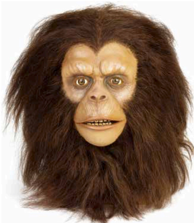
783. PLANET OF THE APES KIM HUNTER "ZIRA" CUSTOM-DISPLAY HEAD. Character display head made for Debbie Reynolds' Las Vegas museum. This impressively detailed head is constructed from foam latex completely covered in hand-punched hair, with hand-painted face and clear-coated eyes. Excellent condition. Measures 13 in. tall. $200 - $300