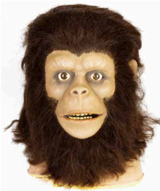
782. PLANET OF THE APES RODDY McDOWELL "CORNELIUS" CUSTOM-DISPLAY HEAD. Character display head made for Debbie Reynolds' Las Vegas museum. This impressively detailed head is constructed from foam latex completely covered in hand-punched hair, with hand-painted face and clear-coated eyes. Excellent condition. Measures 13 in. tall. $200 - $300