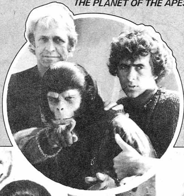
VIRDON, BURKE AND GALEN. FUGITIVES ON THE PLANET OF THE APES.