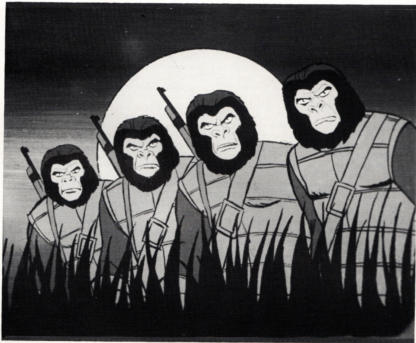
Return to the Planet of the Apes: Typical bad artwork of gorilla soldiers.