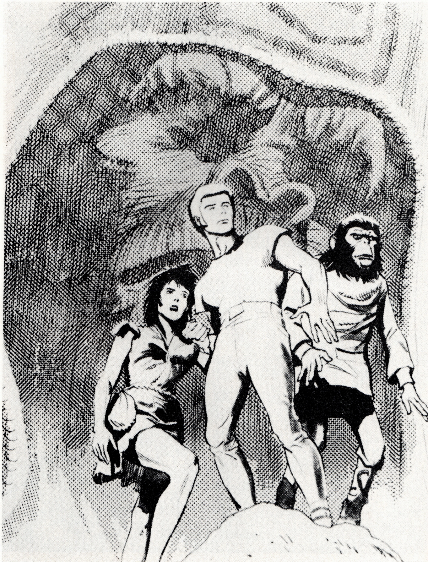
Return to the Planet of the Apes: (left to right) Nova, Bill Hudson, Cornelius; background: General Urko.