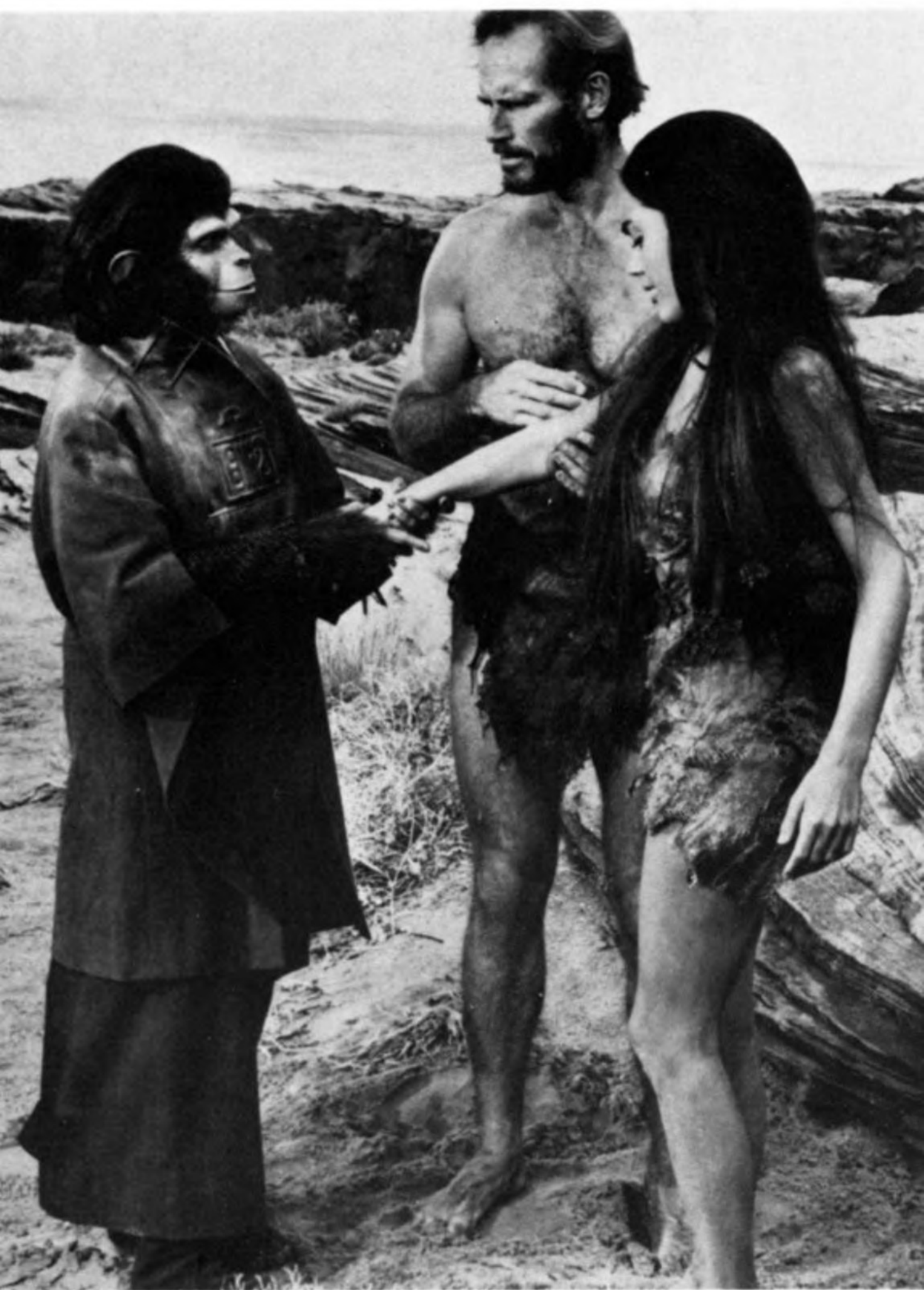
13. Identify the actors and the film.