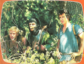
PLANET OF THE APES