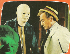
KOLCHAK: THE NIGHT STALKER

SCIENCE FICTION, ADVENTURE AND SUPERHEROES