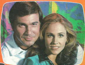
BUCK ROGERS IN THE 25TH CENTURY