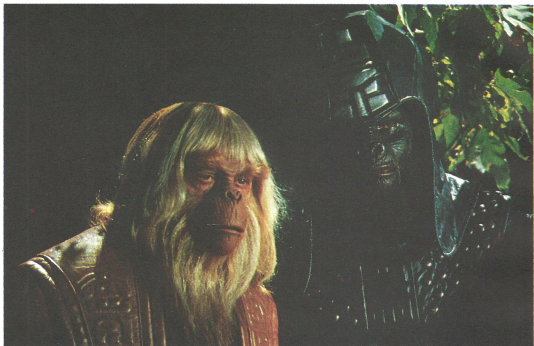
Doctor Zaius (Booth Colman) and General Urko (Mark Lenard) pursue the fugitive humans.