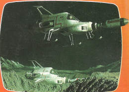
Gerry Anderson's UFO