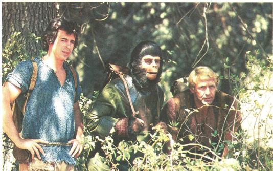
Burke (James Naughton), Galen (Roddy McDowall) and Virdon (Ron Harper) hide from a gorilla patrol.