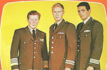
VOYAGE TO THE BOTTOM OF THE SEA