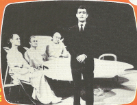
Rod Serling's TWILIGHT ZONE