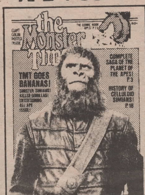
P72 GREAT APE POSTER ... A beautiful giant color poster of the cover to TMT #33. $1.50 plus 60c.