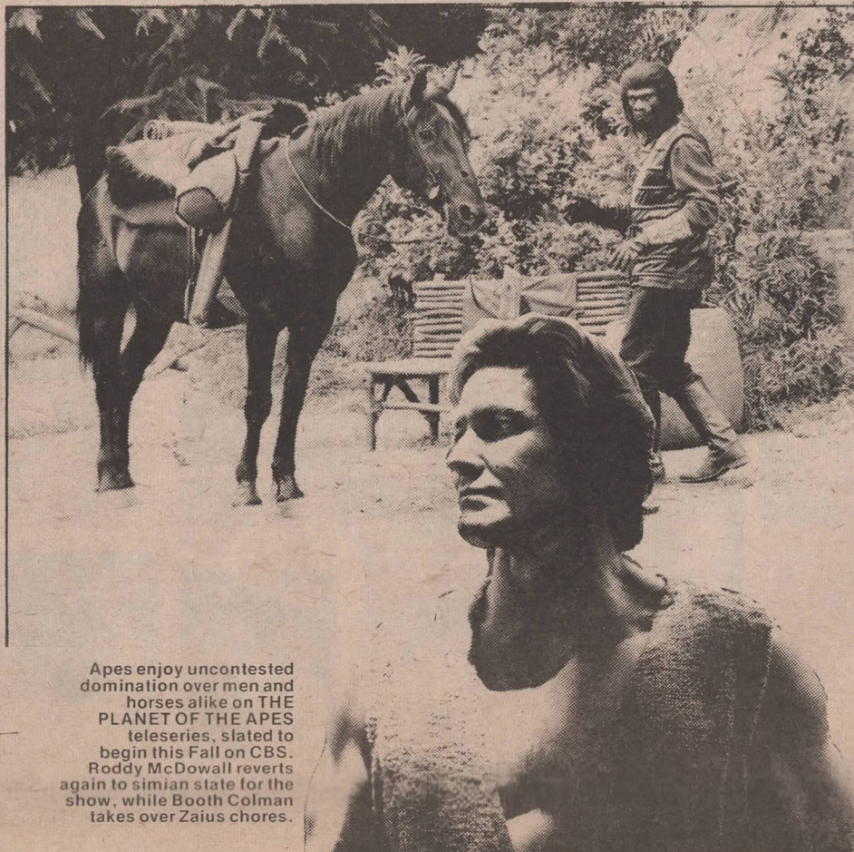
Apes enjoy uncontested domination over men and horses alike on THE PLANET OF THE APES teleseries, slated to begin this Fall on CBS. Roddy McDowall reverts again to simian state for the show, while Booth Colman takes over Zaius chores.

If action dolls aren't your bag, then there are other ape delights. Try the PLANET OF THE APES game, or the PLANET OF THE APES jigsaw puzzles. What about a PLANET OF THE APES watergun for next summer? Or a PLANET OF THE APES parachutist? Just throw Cornelius into the air or off the roof and watch him float to earth! There is also a motorcycleist Cornelius with an action motor.