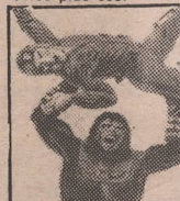
ESCAPE FROM THE PLANET OF THE APES $1.00 plus 35c.