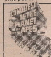
CONQUEST OF THE PLANET OF THE APES $1.00 plus 35c.