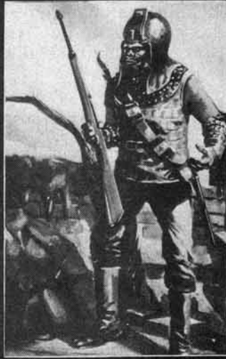
GENERAL URSUS #2467 $3.50