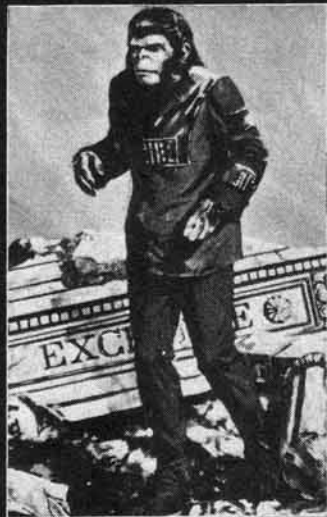
CORNELIUS #2440 $2.50