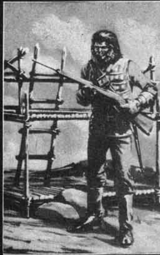
GENERAL ALDO #2468 $3.50