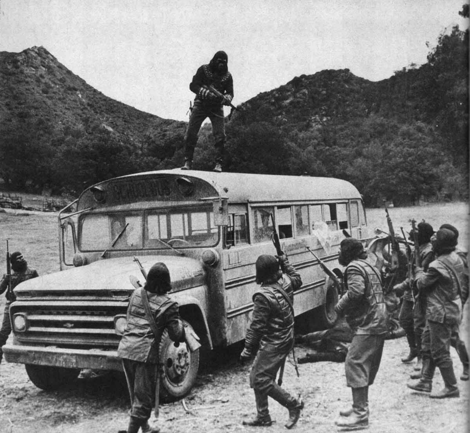
The gorilla guerillas prepare to attack the mutants.

Young FM fan John Landis; who wrote, directed & played the incredible apeman in SCHLOCK ; escaped typecasting by appearing