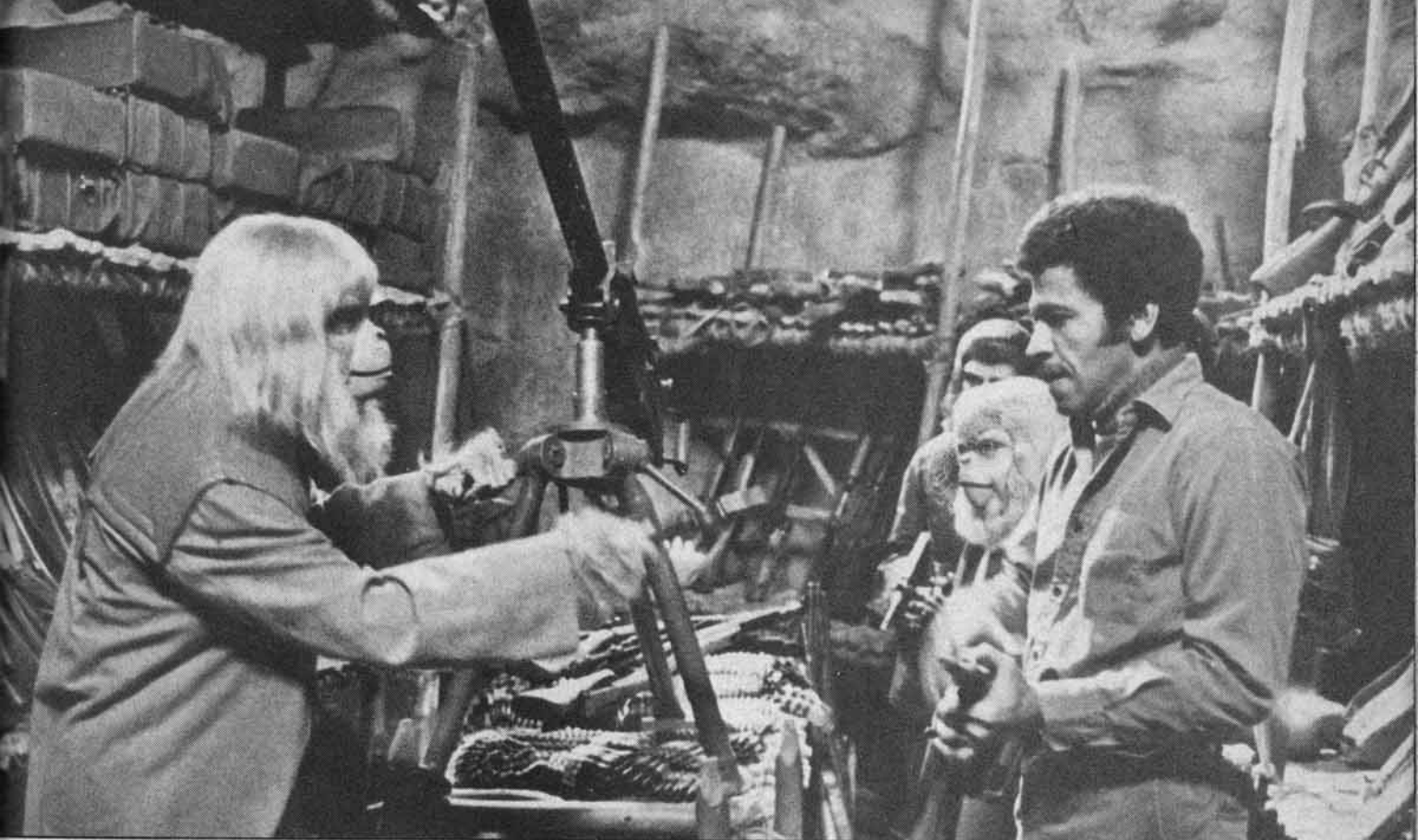
In the arsenal of the apes, Mandemus, Virgil & MacDonald arm themselves to fight.