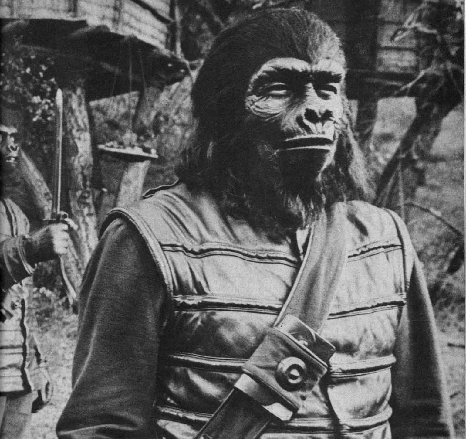
Gorilla Leader Aldo (Claude Akins) drills his rebel troops.