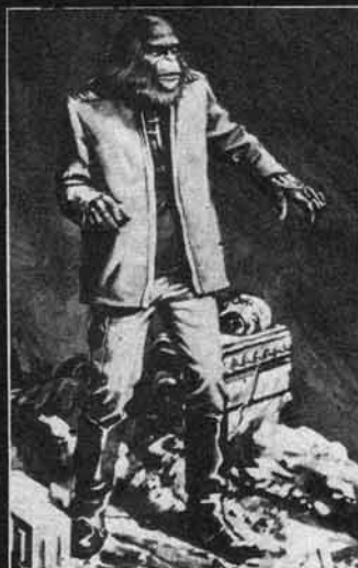
DR. ZAIUS #2441 $2.50