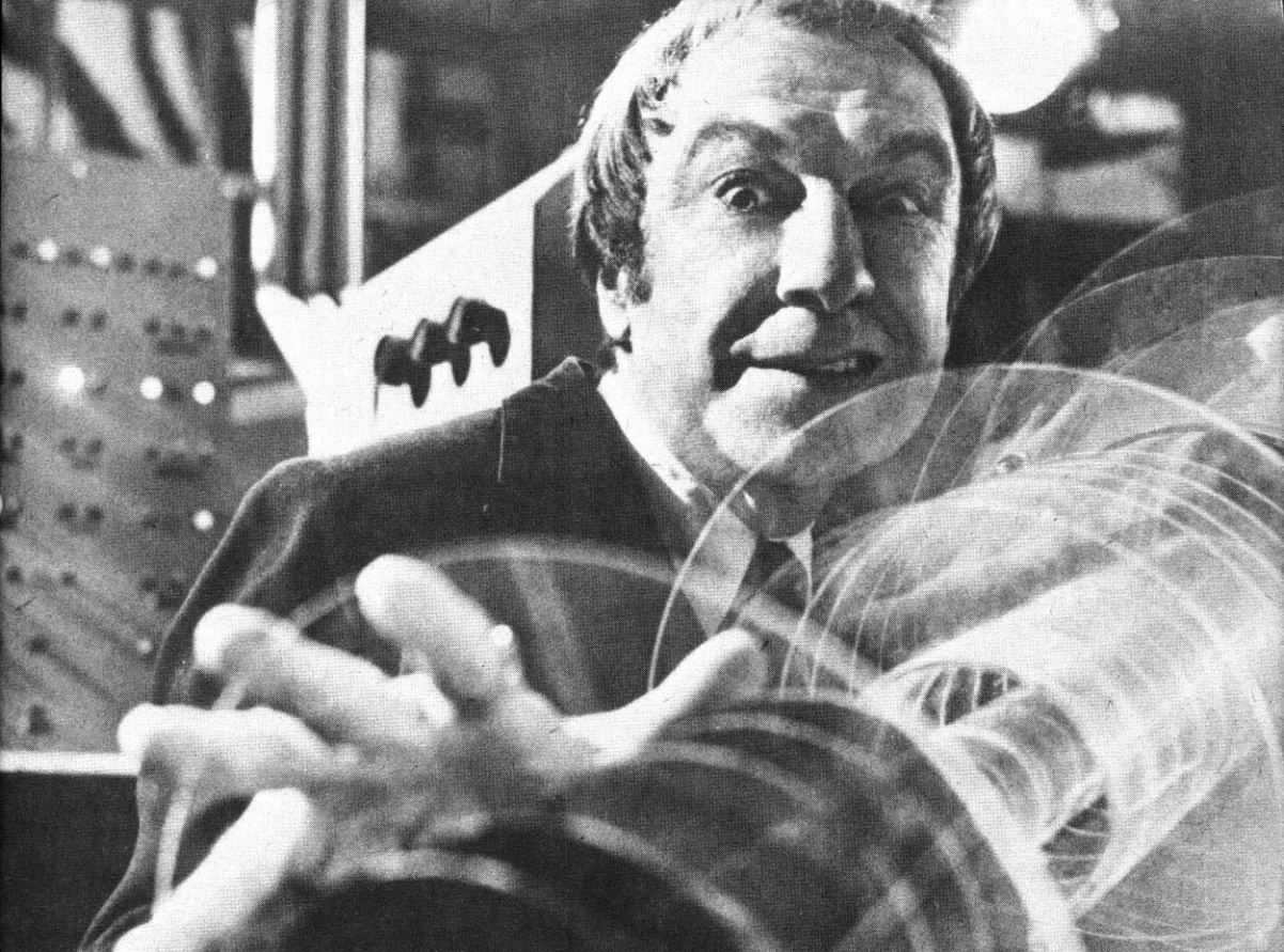
Mad Dr. Shrinker (Jay Robinson) imperils the world every Saturday morning. Tune in your TV for the fiendish glee!

& very encouraging to this beginner. His kindness was extraordinary. In fact, he & the rest of the cast, which included Una O'Connor, who did such marvelous work in THE INVISIBLE MAN and BRIDE OF FRANKENSTEIN , took me under their wing, so to speak.