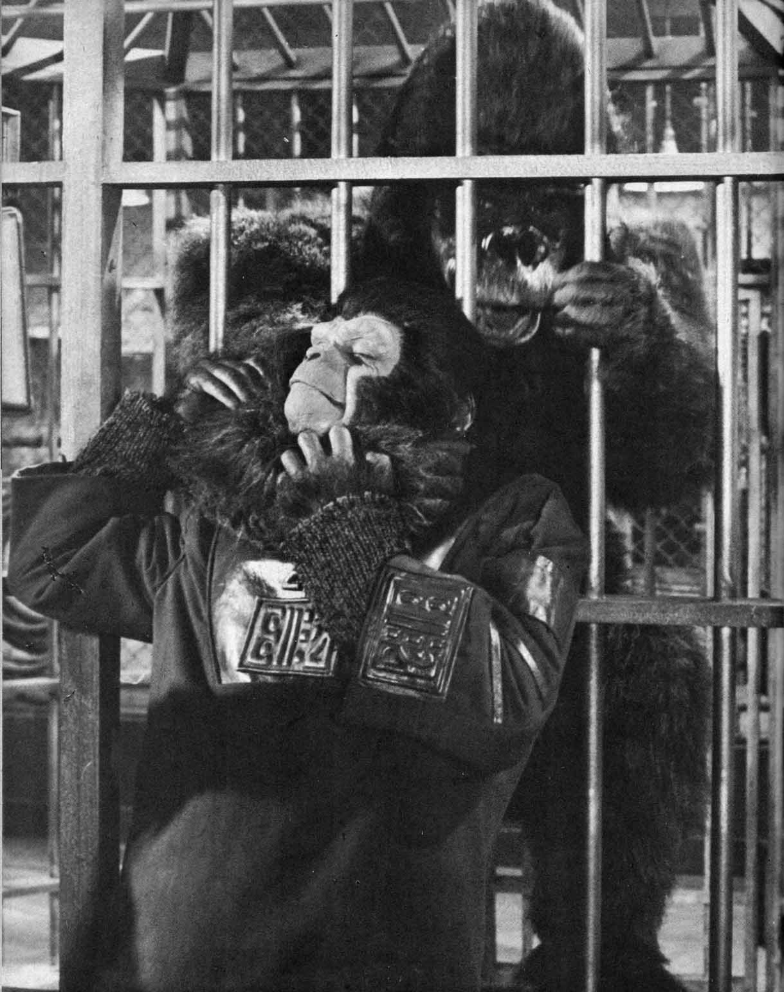
Boy meets Gorilla and the big ape decides to play it cagey!