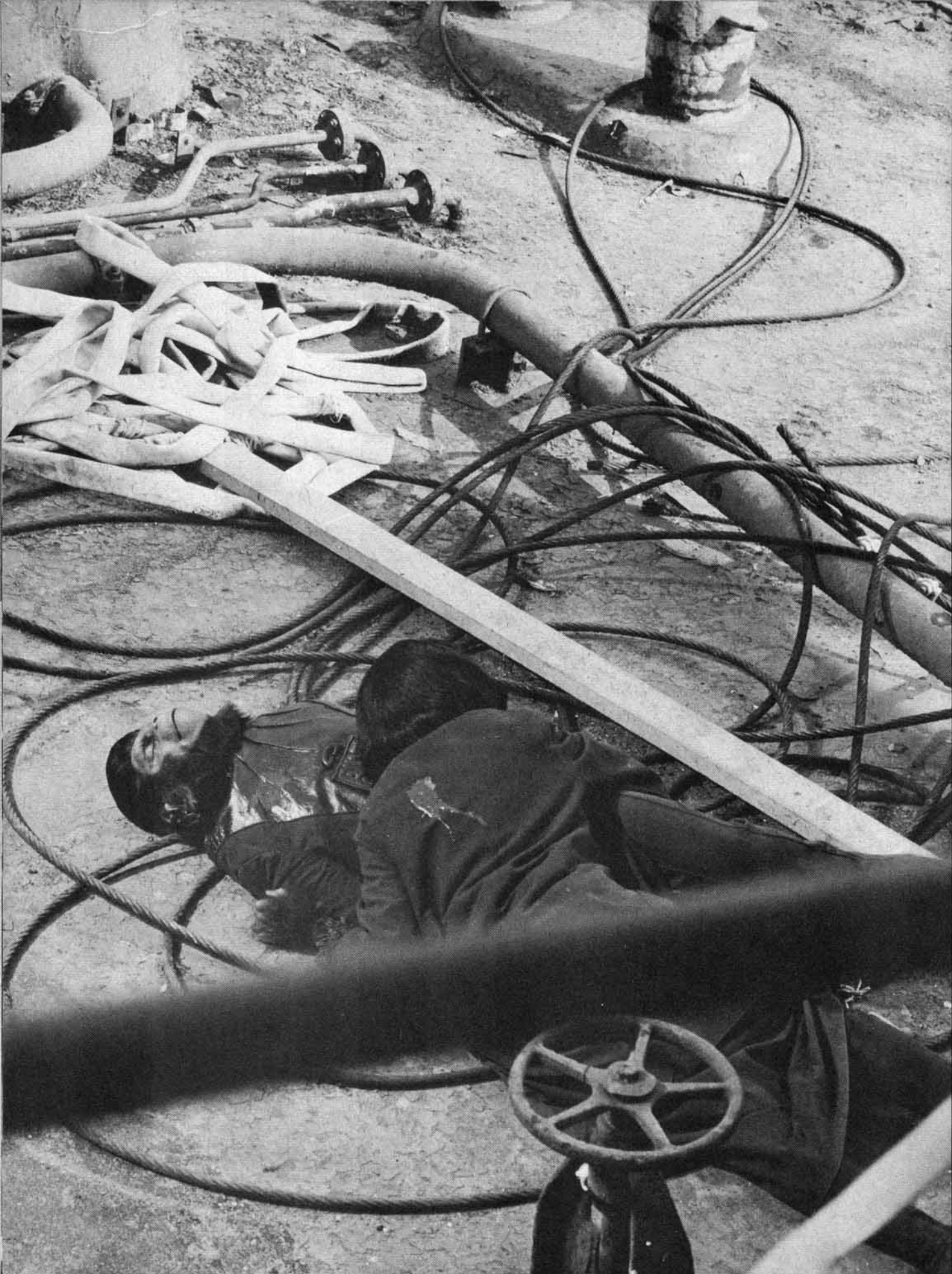
A dramatic moment in ESCAPE FROM THE PLANET OF THE APES . Are they dead or just knocked out?