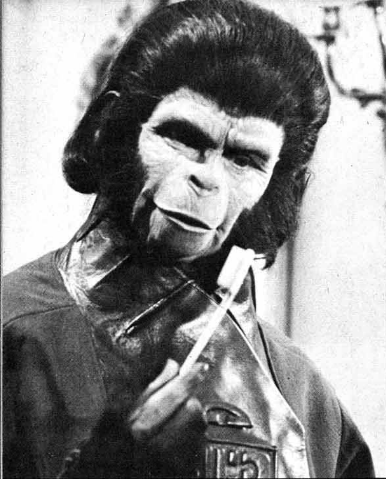
Tooth or consequences? Zira wonders if these humans are giving her the brush off?