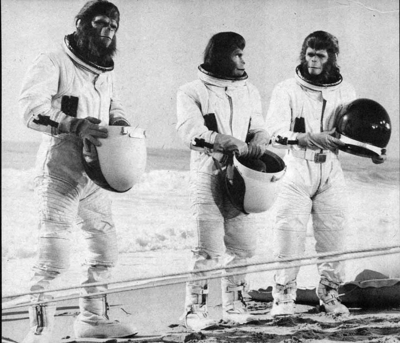
World's first ape-pronauts. They just made a successful splashdown, now they're about to make a splash in society!