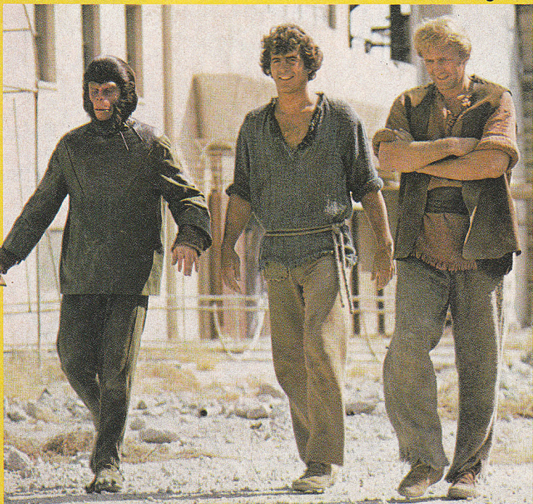
Heading home—McDowall, Naughton & Harper

Human inhabitants live in the Inner Zone (the centre of the ape world) and perform menial tasks, and are subject to the whims of the apes. Unlike in the original