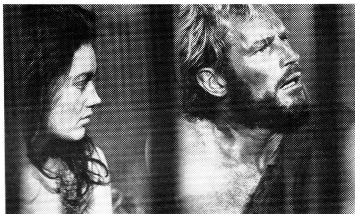
Planet of the Apes

Kim Hunter is Zira and Roddy McDowall is Cornelius in 20th Century-Fox's "ESCAPE FROM THE PLANET OF THE APES" opening ..... at the ..... Theatre as part of a special engagement of "Apes" films. The Arthur P. Jacobs production directed by Ted Post co-stars Bradford Dillman, Sal Mineo, Ricardo Montalban and Albert Salmi.