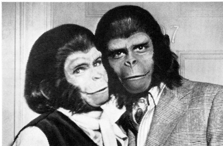
Escape from Planet