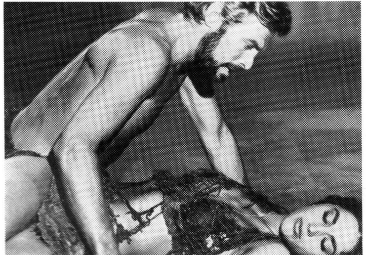
Beneath the Planet of Apes