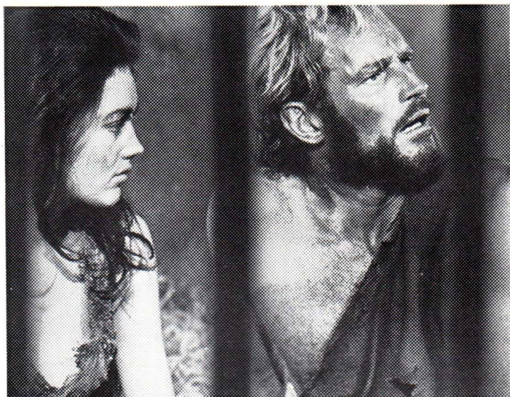
PLANET OF THE APES