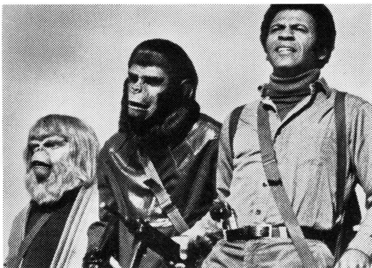
Battle for Planet Apes

J. Lee Thompson directed from a script by John William Corrington and Joyce Hooper Corrington based on Paul Dehn's story. "Battle for the Planet of the Apes" is an Apjac International production for 20th Century-Fox release in Panavision and DeLuxe Color.