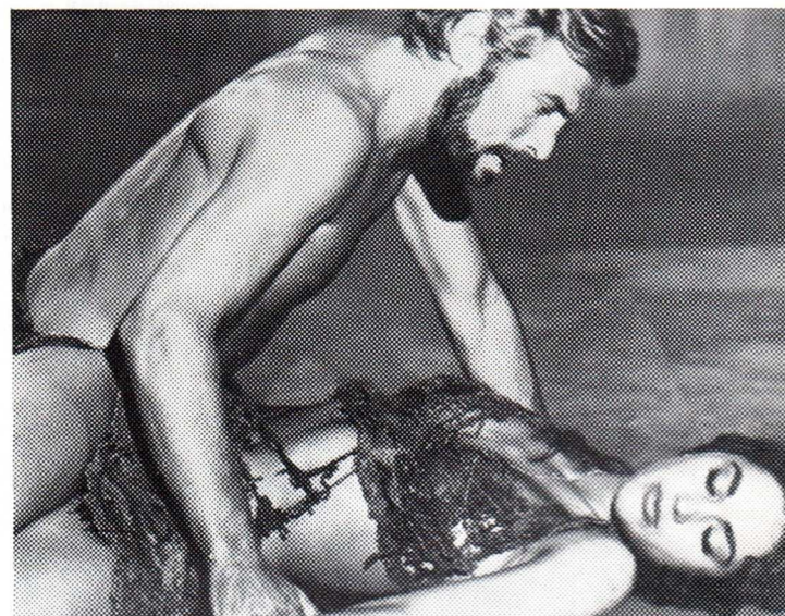
BENEATH THE PLANET OF APES