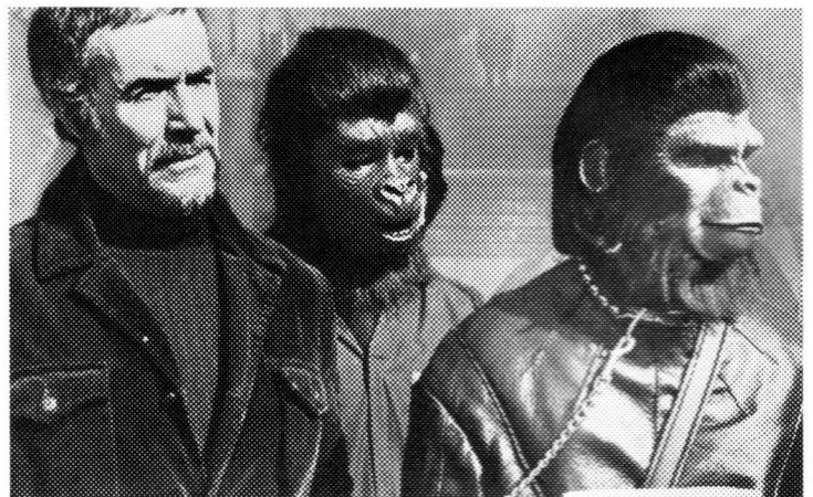
Conquest of Planet

Makeup is again under the supervision of John Chambers, winner of an Oscar for his work on the original film, only the second such award in the Motion Picture Academy's history.