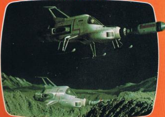
Gerry Anderson's UFO