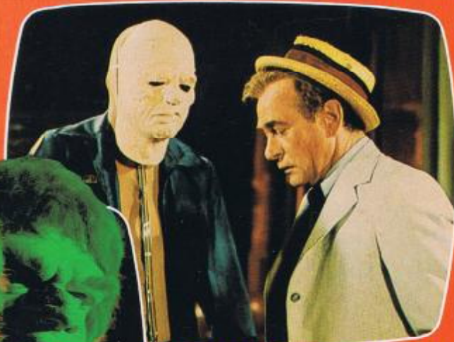
KOLCHAK: THE NIGHT STALKER

SCIENCE FICTION, ADVENTURE AND SUPERHEROES