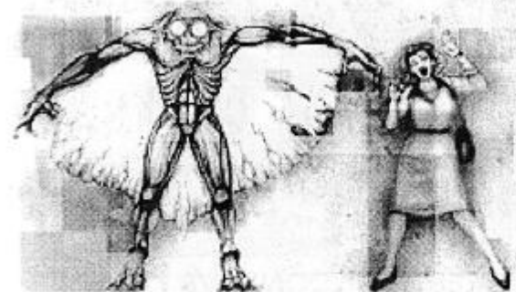
ABOVE: A CI staff writer searches for a late-night bar without a dress code on Finchley High Street.

Look out for these figures this coming autumn.