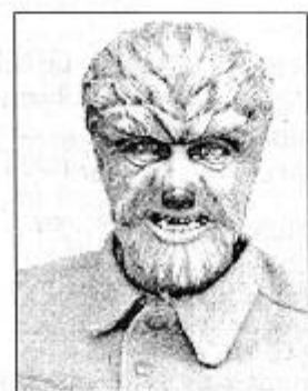
Above: Wolf Man in his 1930s Lon Chaney incarnation.