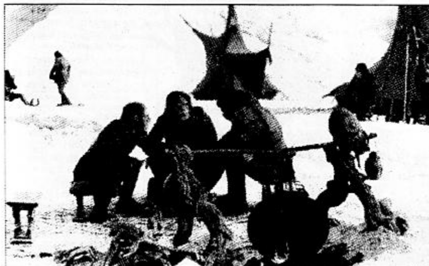
Pictured above are scenes from director Tim Burton's Planet of the Apes which premieres in the US on July 27 and in the UK on August 17. The movie begins in the year 2029, aboard USAF Space Station Oberon, in deep space. The film stars Mark Wahlberg as American astronaut Major Leo Davidson; Helena Bonham-Carter as Ari – a female chimpanzee and a human rights advocate – and Tim Roth as Thade, the ultimate warrior, general of the Ape Army.

Planet of the Apes [Adventure, 1990-92] #1-24 + 64pg annual Planet of the Apes [Adventure, 1990] Trade paperback reprinting Marvel movie adaptation Planet of the Apes: Urchak's Folly [Adventure, 1991] #1-4 Beneath the Planet of the Apes [Adventure, 1991] Trade paperback reprinting Marvel movie adaptation Escape from the Planet of the Apes [Adventure, 1991] Trade paperback reprinting Marvel movie adaptation Terror on the Planet of the Apes [Adventure, 1991] #1-4; Reprints from Marvel b&w magazine Planet of the Apes: Sins of the Fathers [Adventure, 1992] one-shot prequel to first movie Planet of the Apes: Forbidden Zone [Adventure, 1993] #1-4