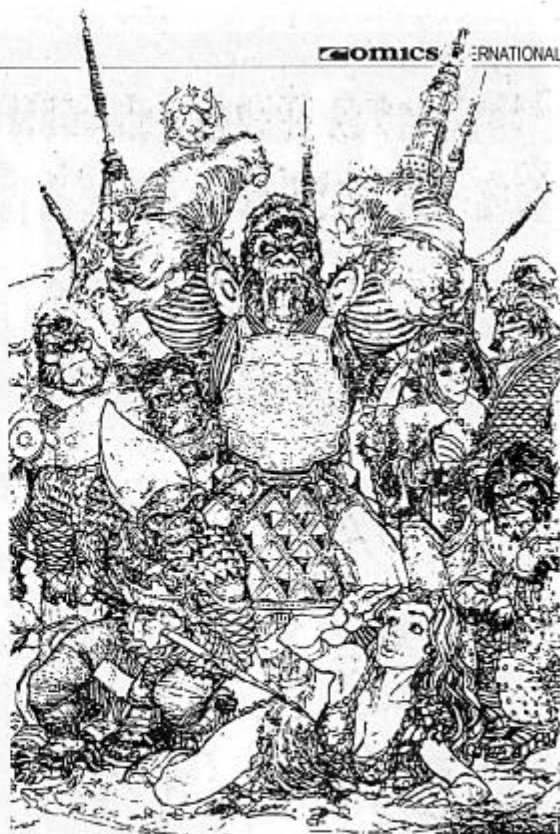
Above: J. Scott Campbell's pencilled cover art to this issue's cover, the second of Dark Horse's Planet of the Apes four-parter.

"Picture hordes of Gorilla cavalry and Chimp infantry in ornate, oriental-style armour, brandishing curved swords, pike staffs and long bows with battle flags fixed to their backs. Picture ape musketeers using early musket technology, their guns lit by fuses and mounted on stands. Picture cannon and mortars, their muzzles shaped like the roaring mouths of Gorillas and so on. I got the job."