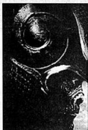
ABOVE: the teaser poster for Fox's summer blockbuster

Hasbro will unveil a line of action figures and collectable toys this month, and will ship them to